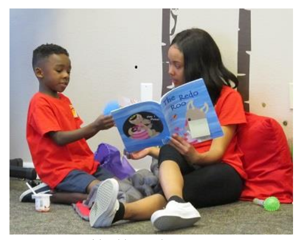
Nurture Group Teaching Redos