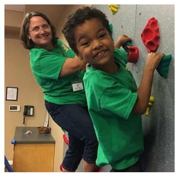
Free Play Rock Wall

Parents are an integral part of the Shining Bright Family Camp. Parents will attend precamp training, camp parent education and participate in camp with their child. If both parents cannot attend the entire time, please discuss with the camp directors. The parent's camp curriculum will include but not be limited to, TBRI®, Nurtured Heart Approach®, Whole Brain Child, and Hand in Hand Parenting. It will also allow for time to relax, practice mindfulness, and get support from others.