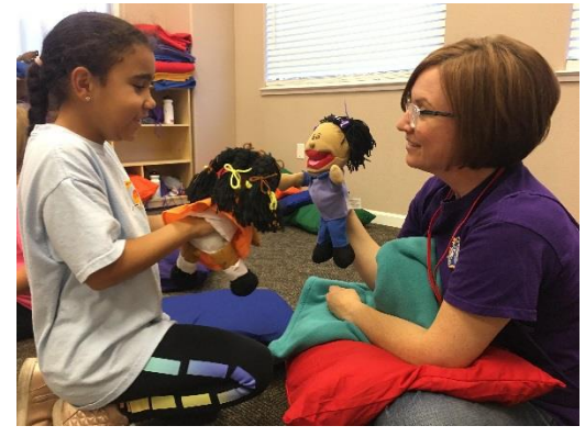
Nurture Group Teaching Try Again with Respect through Puppet Play

We will be selecting 4-6 families based on their ability to benefit from a camp experience and their compatibility with all families being selected. If your family is not selected we will meet with you to discuss other support options.